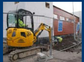
Staff working on water pipe trenches at the attractive timber clad frontage of the new Moray Hydrotherapy Pool at Forres.

they started but will need £25,000 a year to help keep it running.